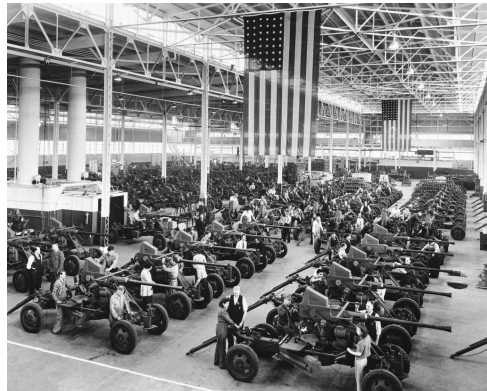
Firestone Tire & Rubber Co. in Akron, Ohio on April 3rd, 1944. When the Japanese within six weeks of Pearl Harbor took control of 90 percent of the world's rubber supply, the U.S. dropped the speed limit to 35 mph to protect tires, and then, in three years, invented from scratch a synthetic-rubber industry.

With slogans like “24/7” celebrating complete dedication to the workplace, men and women exhausted themselves in jobs that only reinforced their isolation from their families. The average American father spends less than 20 minutes a day in direct communication with his child. By the time a youth reaches 18, he or she will have spent fully two years watching television or staring at a laptop screen, contributing to an obesity epidemic that the Joint Chiefs have called a national security crisis.